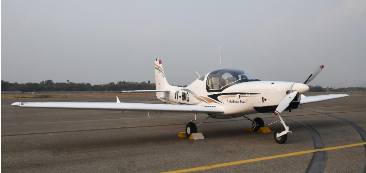
Note: Representative Figure Figure 2: Hansa-3(NG) configuration

Hansa-3(NG) maiden flight was successfully conducted on September 3, 2021 and so far all test flights have been completed. DGCA has successfully approved all the modification leaflets and CSIR-NAL is awaiting for TCDS to proceed with the limited series production of Hansa-3(NG) aircraft.