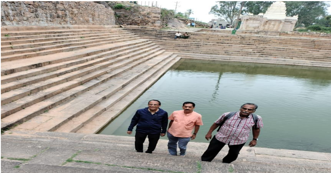
Akka Thangi Kola