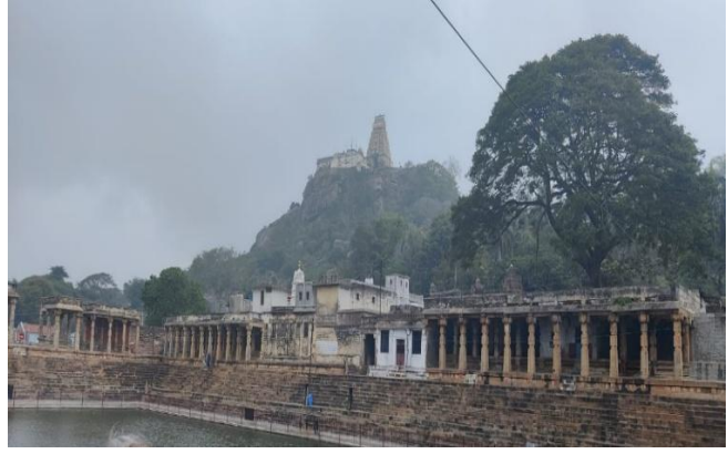
View of Lord Yoganarasimhaswamy Temple from the Pushkarni tank.

After having a brief “prokshana” ( sprinkling of Holy water over our heads) of Pushkarni Water, we proceeded to Subbanna Mess for our Lunch.