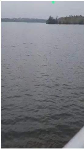
A View of Thonnur Kere