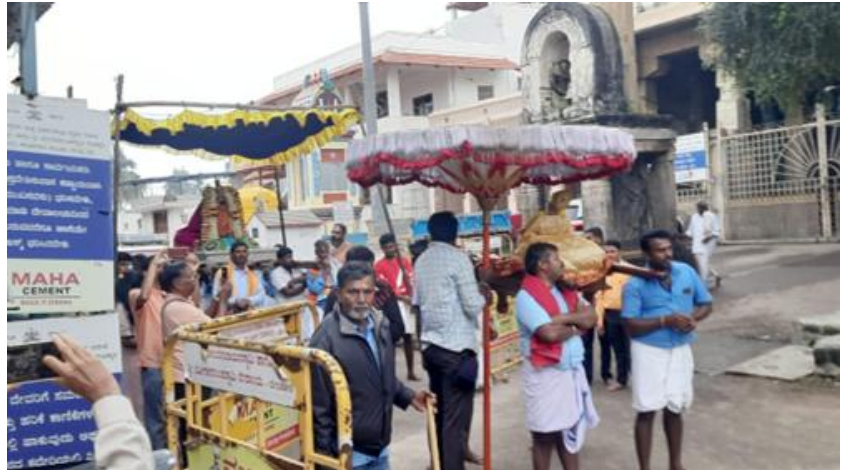
A view of Lord Cheluvanarayan Temple Uthsavamurthy procession

After completing the darshan of Lord Cheluvanarayan Temple, we hired autorickshaws to travel half way to the steps to have a Darshan of Lord Yoganarasimhaswamy. This Temple is situated at the top of the Yadugiri hillock. We have to climb a few hundred steps to enter the temple as can be seen in the photos.