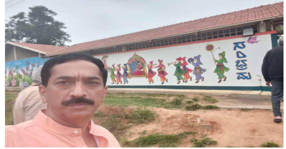
Breakfast at Sambrama Hotel