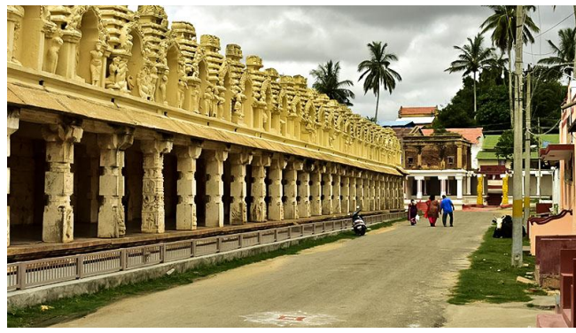
Lord Cheluvanarayan Temple at Melukote