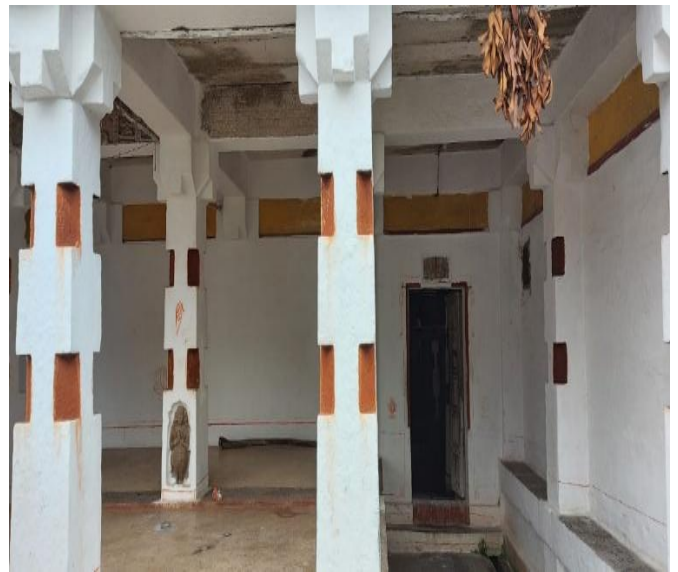
An ancient residential House in Melukote