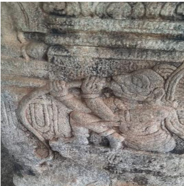
Hooka Smoking carving on a pillar a surprising aberration to a divine place in Melukote