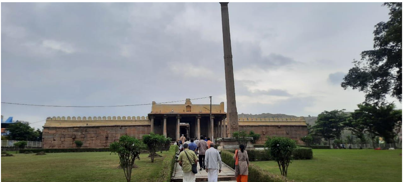
Lord Nambi Narayana Temple ( 20 Kms from Melkote )

From Kote Bagilu we travelled back to our Bus Parked in Melkote Town by autorickshaws. All of boarded back into the Bus and travelled for about 15 mins to Shri Nambi Narayana Temple and had darshan of Lord Nambi Narayana.