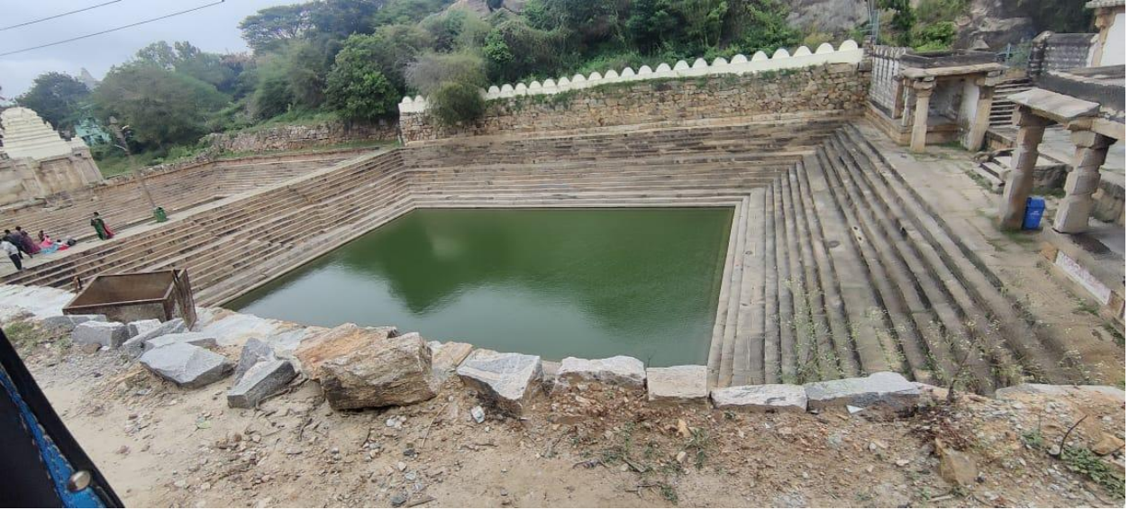
Veda Pushkarni where Shri Ramanujam took Deeksha