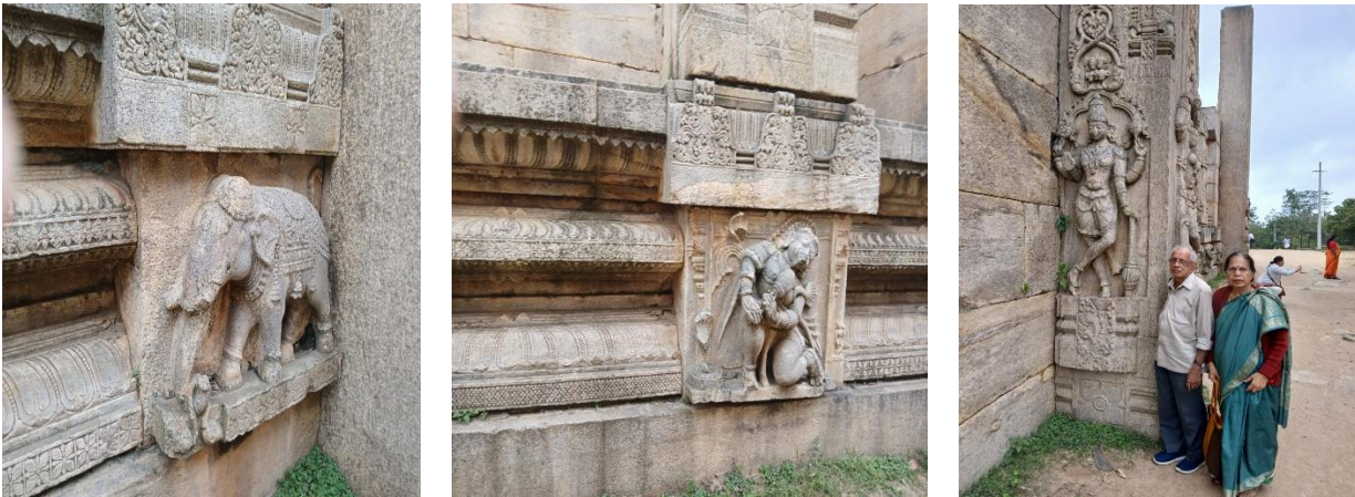
Carvings at Kote Bagilu