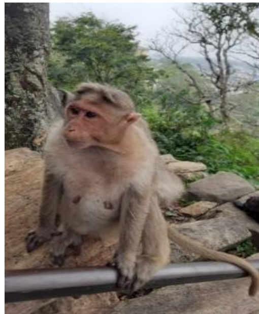
Ever Present Monkeys attacks pilgrims protect yourself with sticks.

The Melukote Trip ended happily with all the families returning to their homes safely.