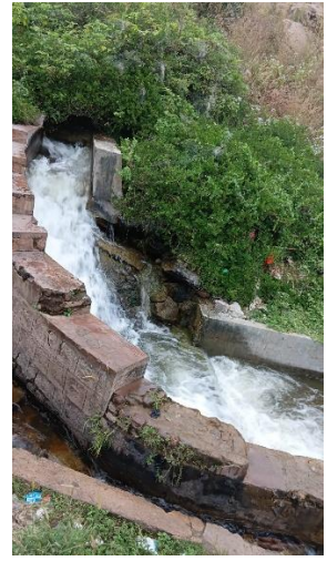
Water flowing out of Thonnur Kere for irrigation

Adjoining the Thonnur Kere is Magnificent Large Statue of Shri Ramanajacharya, the great Vaishnava saint has been installed and surrounded by a beautiful garden. . According to historians, in the 12 th century, the great Vaishnava saint, Sri Ramanujacharya lived here for 14 years and thus Melukote has become a spiritual centre for Vaishnavites. Shri Ramanujacharya's spiritual impact was quite impressive that he could convert the contemporary Jain King Bittideva into Vaishnavism and renamed him as King Vishnuvardhana who constructed the world famous Lord Chennakeshava Temple in Belur known for its intricate and delicate carvings. Vasihnavites were hounded out adjoining Tamil Kingdom of Cholas who were staunch Saivites ( Devotees of Lord Shiva ), and thus Shri Ramanujacharya took refuge in Karnataka at Melukote.