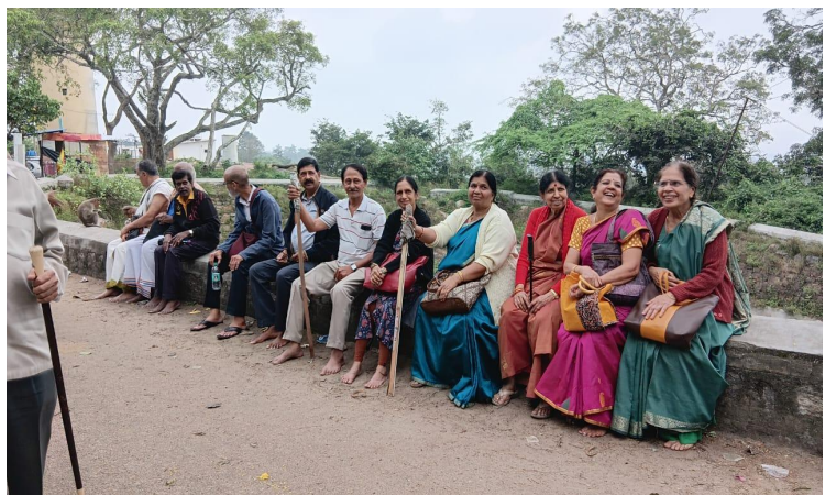
Lord Yoganarasimha Temple , climbing steps and taking rest after climbing down the steps.

After climbing down the steps, we again travelled in autorickshaws to the Pushkarni Tank of Melukote.